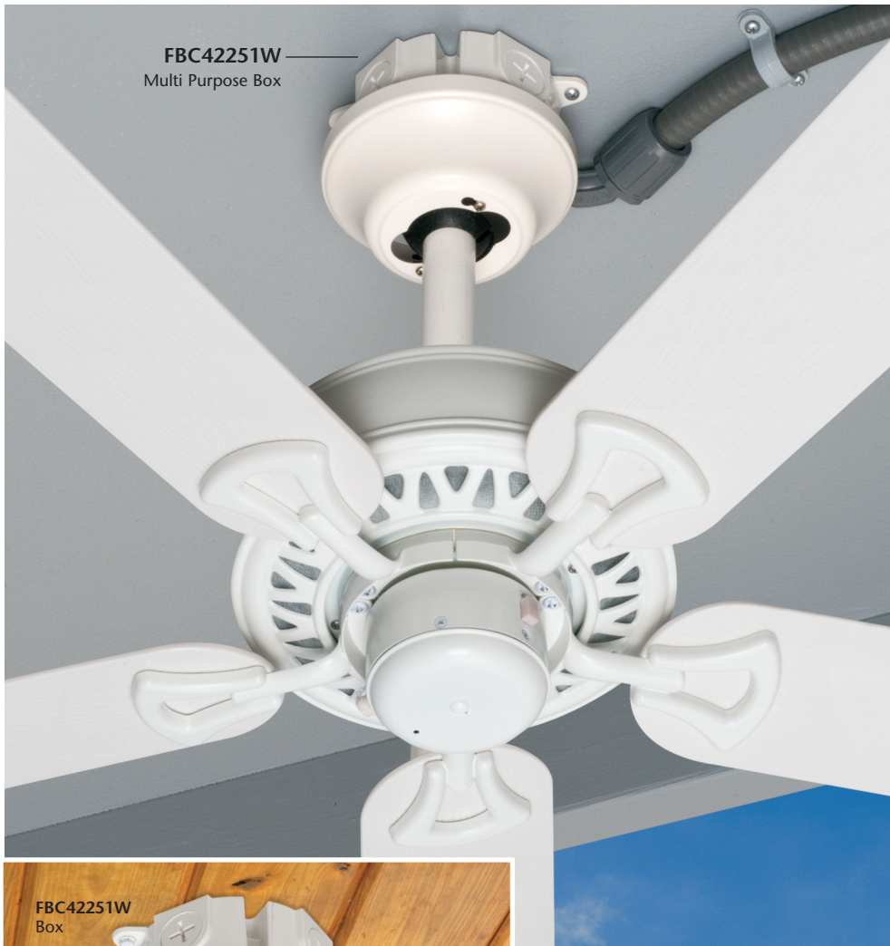
FBC42251W Multi Purpose Box

Raintight, Sealed Box for Wet or Damp Exterior Locations