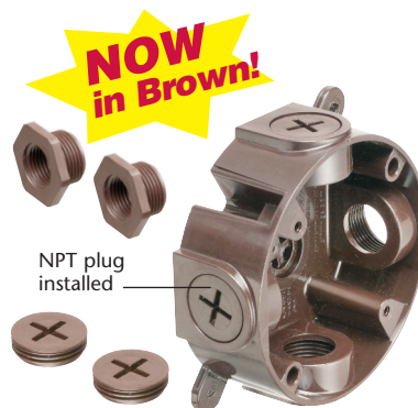
FBC42251BR Box components Includes screws for fan installation

Arlington's non-metallic 21.8 cu. inch MULTI PURPOSE BOX is the labor-saving solution to installing a fan, light fixture or security camera that's exposed to the elements – inside or outside. This MULTI PURPOSE BOX eliminates the need for time-consuming field modifications.