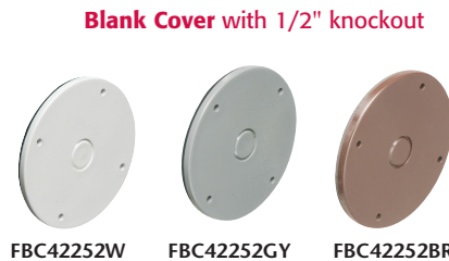
Blank Cover with 1/2" knockout

Includes non-metallic cover with 1/2" knockout, (1) gasket and (4) #6-32 mounting screws.