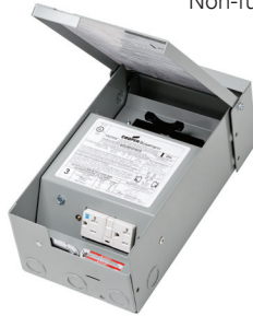
Non-fused disconnect with GFCI receptacle.