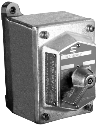
DSD-SR cover assembly (shown mounted to an EDS back box)