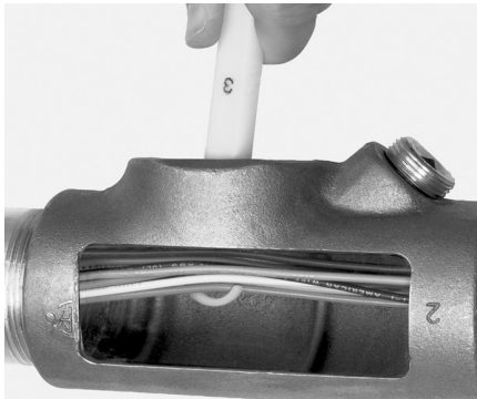
The large hook on tool #3 quickly lifts all the conductors