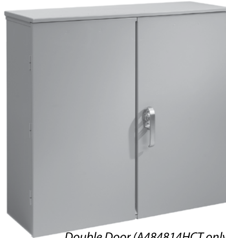
Double Door (A484814HCT only)