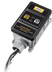
Manual Reset GFCI