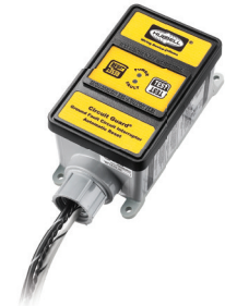
Automatic Reset GFCI