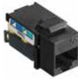
Snap Fit Jack NSJ5EBK