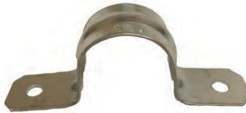
Two Hole Straps