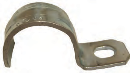
One Hole Straps